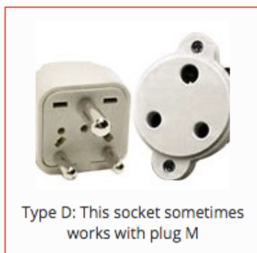
Type D: This socket sometimes works with plug M