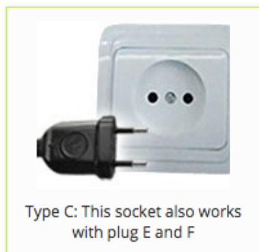
Type C: This socket also works with plug E and F

The Nepalese electricity supply is 220/230 volts AC 50 HZ. Up in the rural areas (Upper Mustang), electricity is not always available 24/7. In Nepal the power sockets used are of type C, D and M. More info you can find here: http://www.power-plugs-sockets.com/nepal/