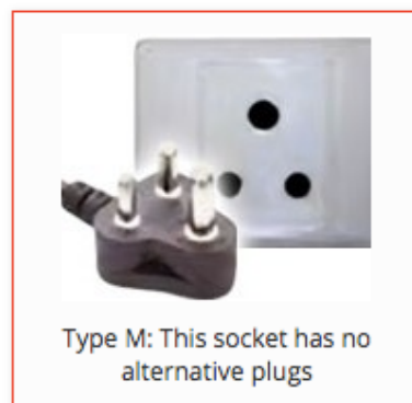
Type M: This socket has no alternative plugs

In some of the guesthouses we'll stay they have a limited period of time per day or no electricity. So we recommend to bring a power pack in case you need to charge your phone/camera.