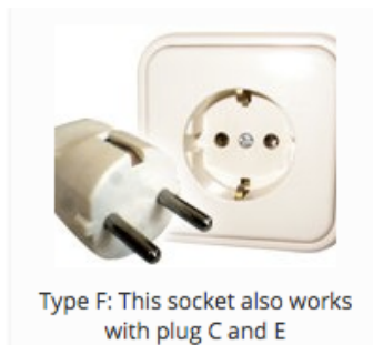
Type F: This socket also works with plug C and E

Water in Iceland is very clean and safe to drink. It's actually one of the cleanest in the world. You can even drink from (some) clear-water rivers and streams!