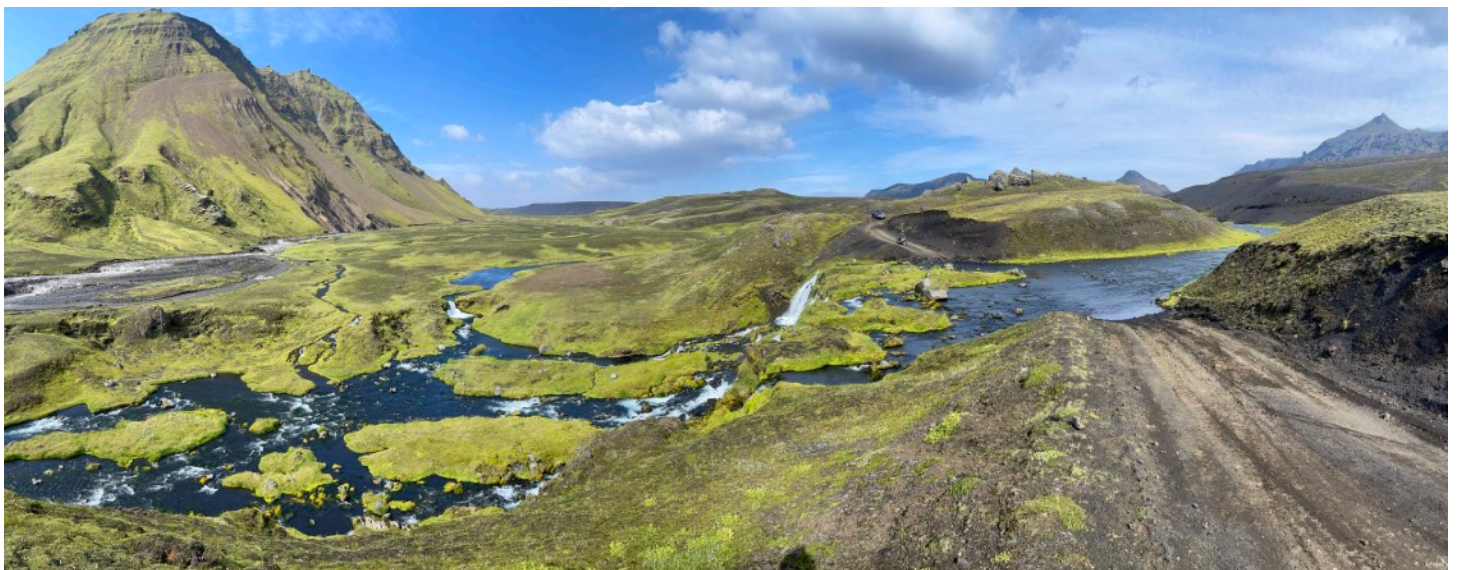
Many rivers to cross

We do want to emphasise that for this tour you need to be healthy and in a good physical condition. The riding, in combination with the weather can make it challenging en strenuous.